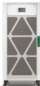
Easy UPS 3M 200 kVA UPS for external batteries