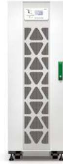
Easy UPS 3S 30-40 kVA UPS with internal batteries