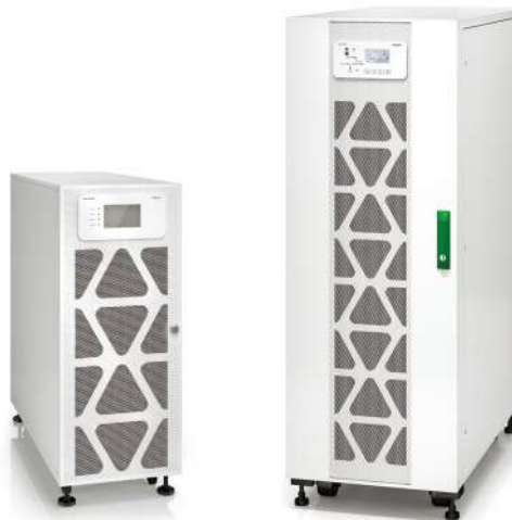
100 kVA Easy UPS 3M for external batteries

**Included with Easy UPS 3M; recommended service option for Easy UPS 3S