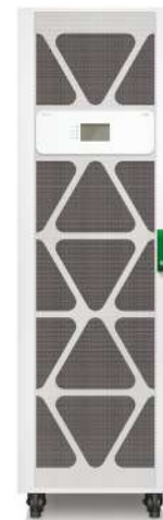
Easy UPS 3M 60-80 kVA UPS with internal batteries